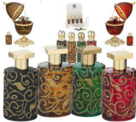
2024 – 2025 Feeling Collection