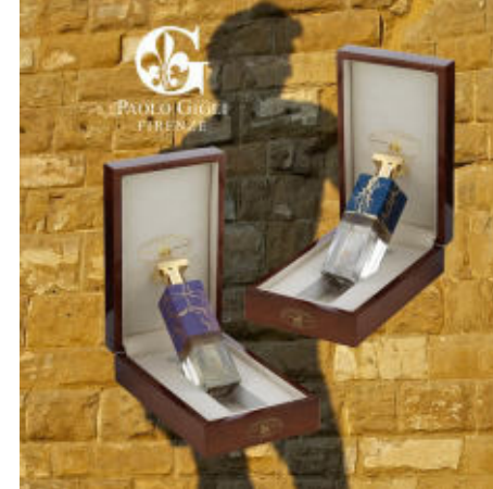
Golden Road Collection