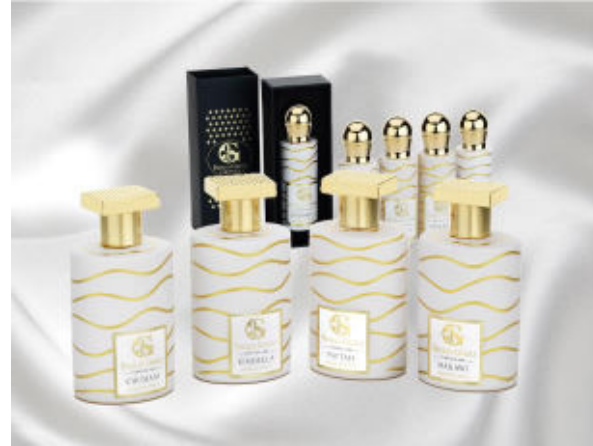
The Spirit of Mother Earth