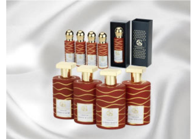
The Secret of the universe